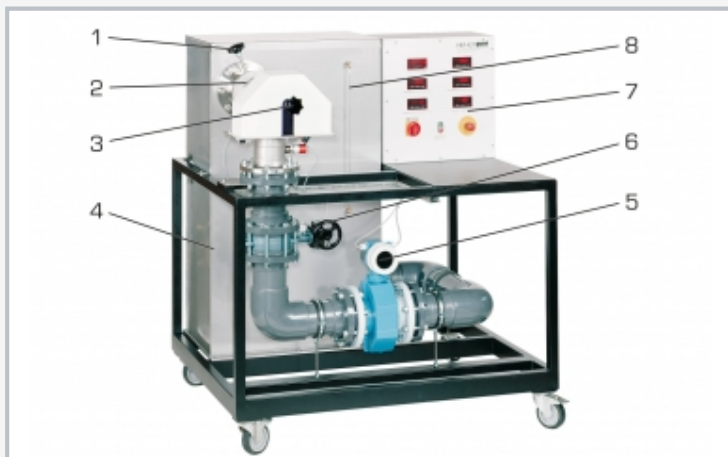
1 lever for adjusting the guide vanes, 2 Propeller type turbine, 3 brake, 4 tank with submersible pump, 5 flow rate sensor, 6 handwheel for throttle valve, 7 switch cabinet, 8 level indicator for tank